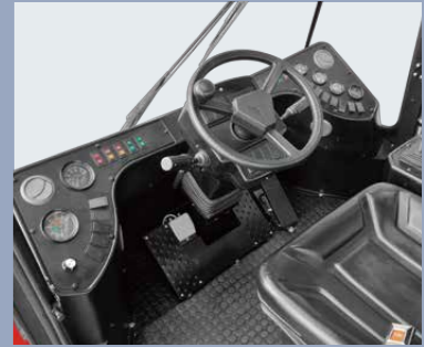
Rema tiller head