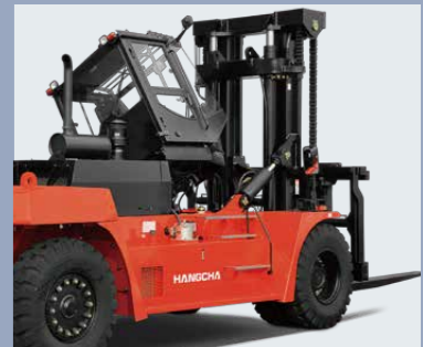
Auxiliary wheels are equipped to have better stability