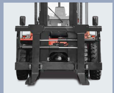
Modern outline design